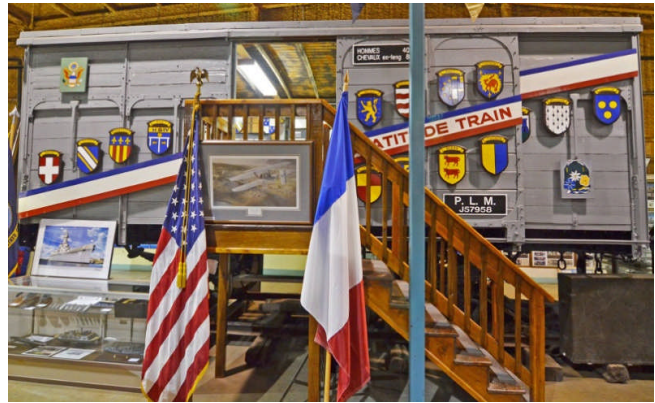
The "40 & 8" boxcar on display at the U.S. Veterans Memorial Museum.

At the Huntsville Depot, volunteers rebuilt the boxcar to the condition it was in when it arrived in Alabama. Unfortunately, the decorations carried at original delivery were no longer documented, and researcher used the markings of the North Carolina boxcar instead. The "40 & 8" Voiture 1012 requested that the restored boxcar be moved into the Round House to protect it from the weather but the Huntsville Depot declined due to space issues.