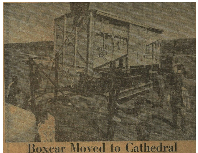
The "40 & 8" boxcar being loaded for its trip to Cathedral Caverns.

The 1879 boxcar was given to the State of Alabama on February 11, 1949. The boxcar was then given to the Huntsville's "40 & 8" Society, Voiture 1012. The "40 & 8" was a subgroup within the American Legion at that time and was designated as the official custodian of the boxcar. Voiture 1012 is located in Huntsville and at that time was the sole chapter in Alabama. The "40 & 8" boxcar was parked on an unused siding of the Norfolk & Southern Railway on American Legion Post 237 property behind the Hullabaloo Club on South Memorial Parkway. The boxcar remained on the property after the property was sold to an individual. In 1968 the Madison County Sheriff raided the "40 & 8" boxcar and destroyed 12 slot machines being stored in the old boxcar.